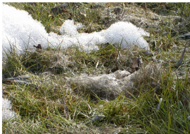
Figure 2: Snow mold is commonly seen in spring on Montana lawns.

Although they are a minor problem, you may encounter several diseases in a lawn. Most are caused by fungi that attack leaves and cause grass thinning. Fertilizers containing sulfur (a fungicide) reduce disease incidence. Maintenance practices which favor lush lawns, e.g., over-fertilization, over-watering, excessive thatch and mowing can all lead to disease development.