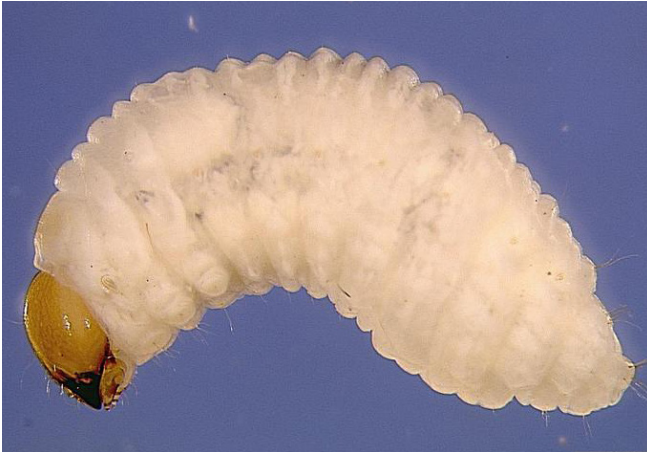
Figure 3. May beetle larva or “White grub.” Phyllophaga sp.

May and June beetles ( Phyllophaga spp., Polyphylla spp.)— These are the most common white grubs found in turfgrass in Montana (Figure 3). Adult beetles can also be found at porch lights in May and June.